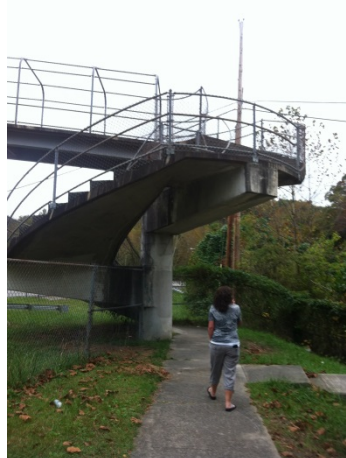
Pedestrian Bridge connecting to playground