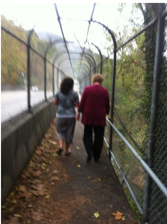
Covered bridge over Looney Creek

Cumberland’s City River Walk is a 1-mile greenway that crosses two bridges that provides scenic overlooks of Looney Creek. A pedestrian bridge over Hwy 119 enables residents to safely access both the river walk and the R.E. “Bob” Frazier City Park & Playground. There is ample parking in the large school parking lot on the opposite side of Hwy 119. See River Walk Photo Tour for more on surrounding amenities and recommendations.