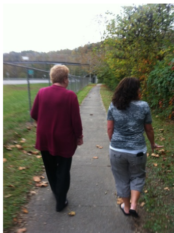
River Walk parallels both KY 119 and Looney Creek.